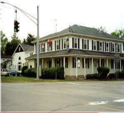
Picture of Tillman's Village Inn on the corner of 98 and 104 today.